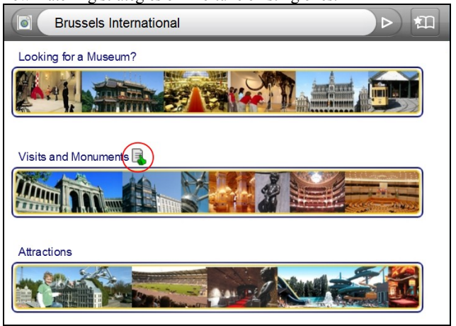
Fig 4. (screenshot 1) Tourist page of Brussels' website.

Developers can add support for other matching strategies by encapsulating their strategy in a SPARQL query and providing it to the COIN API. Future work includes making the specification of matching strategies more user-friendly, so users themselves can add new matching strategies or fine-tune existing ones.