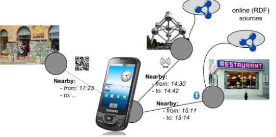
Fig. 2. An example Environment Model.