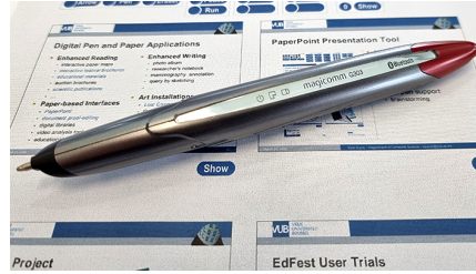
(d) Aoto Digital Pen (Magicomm G303)