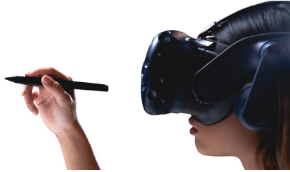
(c) Massless Pen (courtesy of Massless Corp.)