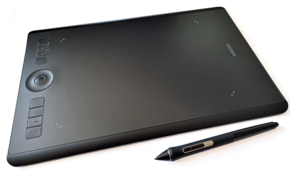
(b) Wacom Intuos Pro graphics tablet