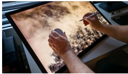
(a) Microsoft Surface Studio 2