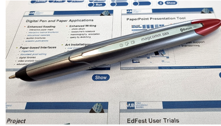
(d) Aoto Digital Pen (Magicomm G303)