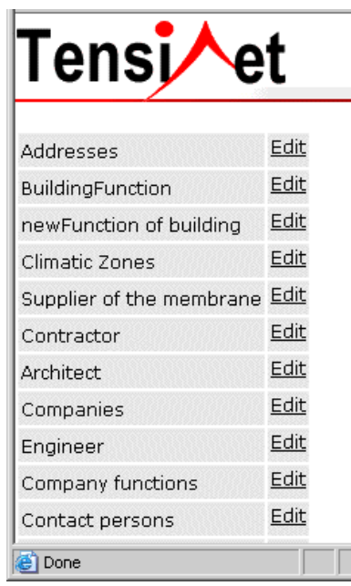
Figure 1: List of all Object Classes in the TensiNet website

rights (explained later on). If a visitor of the website has unlimited access, a possible way to start off is with a web page showing the list of all object classes (see figure 1). The object classes are given by means of their name and with each object class an Edit-button is associated. Clicking on the name of such an object class gives a page with a list of all instances of that class. (Clicking on the Edit button associated with such an object class will allow to add, delete or edit instances of that object class.) Clicking on one of the object instances in the list of instances will give a page with the values of the attributes of the selected object instance. Because an object class may have many different attributes, the designer can opt to group attributes together. E.g. Street, House-Number, ZIP-code, City and Country can be grouped as "Address". This allows displaying the information associated with an object instance in a more structured way (see figure 2).